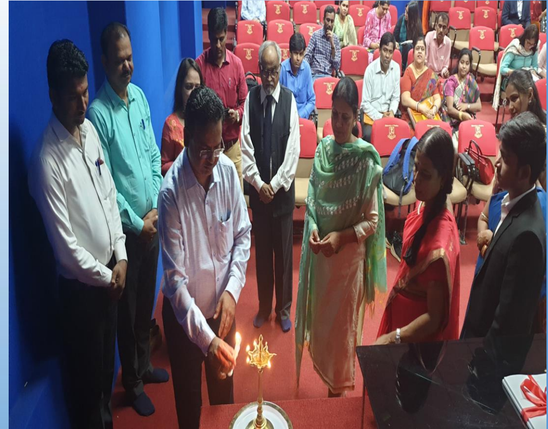
Lightening of Lamp