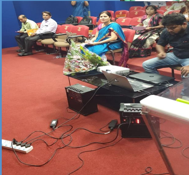
Chairperson of Technical Session-1