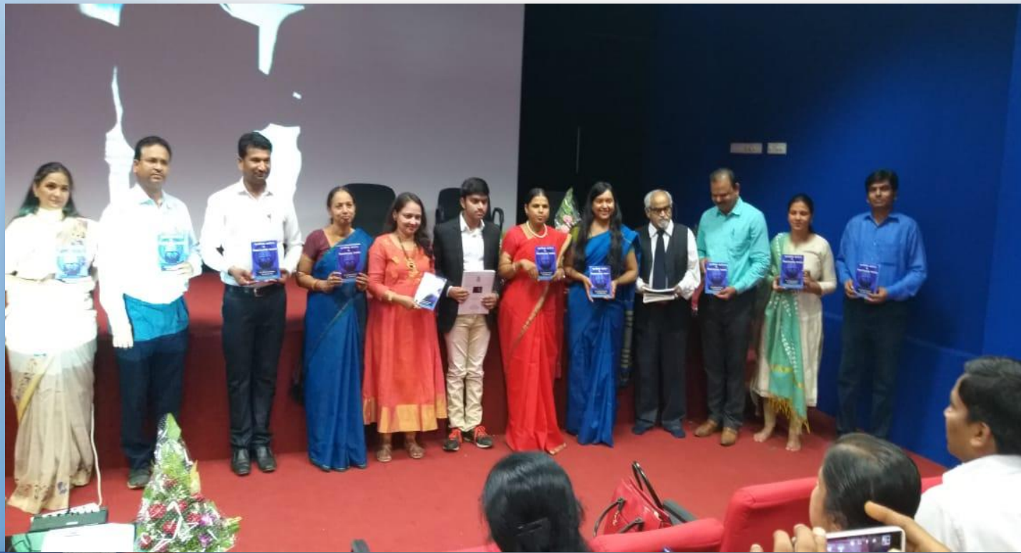
Inauguration of Book