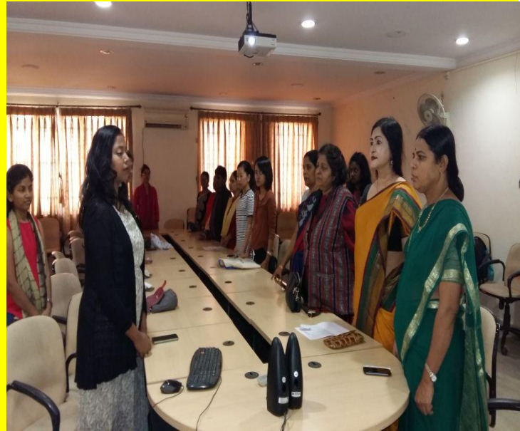
Singing the University Song