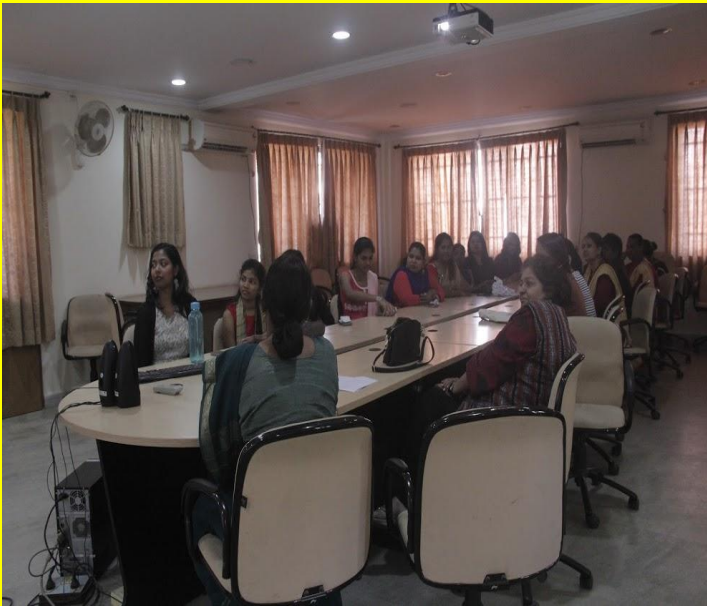
Hostelites gathered for the event at the Department of Education, University of Mumbai