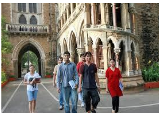
Fort Campus, Fort, Mumbai